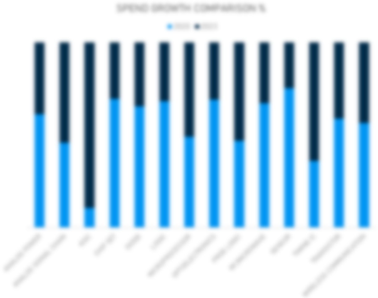
Data based on Jabil's historical spend data for Smart Home Customer Segment